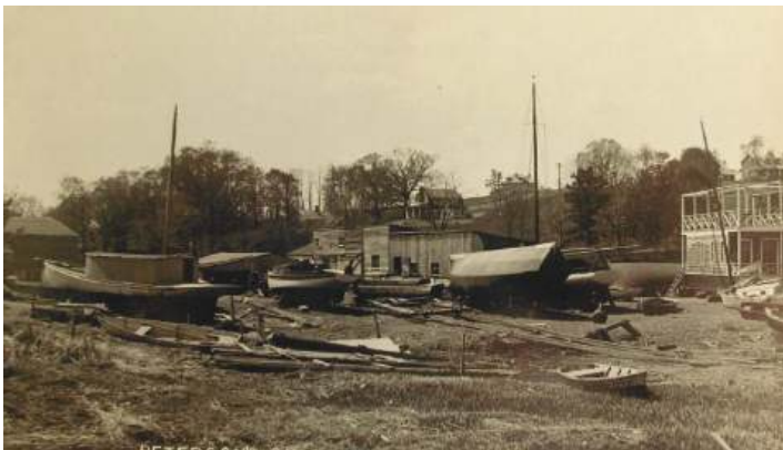
Boat yard in 1911 at what is now Virginia Point; Douglas Manor in the background.

Filling of the Douglaston and Little Neck "swamps" started in earnest around 1960. On the west side, behind PS-98, a developer filled in a large area of marshlands, laid out streets, and built a model home at the intersection of 38th Drive and 233rd Streets (south of Parson's Point, which was itself developed a few years later). A family named Guidice – a couple with three children – moved into the model home. Alas, the weight of the structure on the unstable fill caused the house to settle. One tragic night the gas line serving the house consequently cracked. The house exploded. Two members of the family died and the other three were severely injured. The tragedy halted development for a few years, but in due course a new developer completed the build-out of the area, now named Doug-Bay. The homes were all electric, with no gas service.