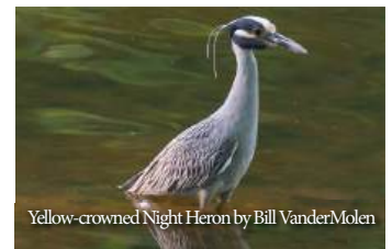
Yellow-crowned Night Heron