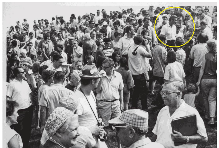
1969: The Walk in the Alley; Mayor John Lindsay is circled.

The rising wave of environmental activism in our own area brought then Mayor John Lindsay to the northeast corner of Queens in 1969 for his famous "Walk in the Alley." Accompanied by some 2000 citizens who demanded that what little of nature was left to us should be saved, Lindsay toured the Alley Creek area north of the Long Island Expressway and concluded that it should be preserved as a northerly extension of Alley Pond Park.