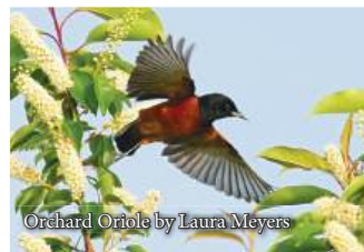
Orchard Oriole