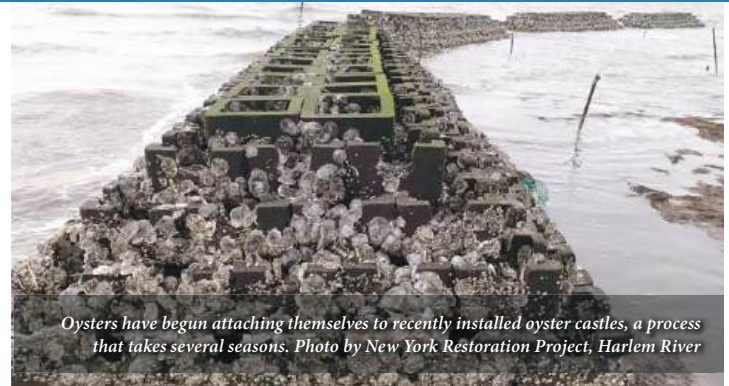
Oysters have begun attaching themselves to recently installed oyster castles, a process that takes several seasons. Photo by New York Restoration Project, Harlem River

Oysters, which made New York City “The Oyster Capital of the World” in the 19th century, will play a prominent role in the Big Rock Restoration Project, but in an entirely new way.