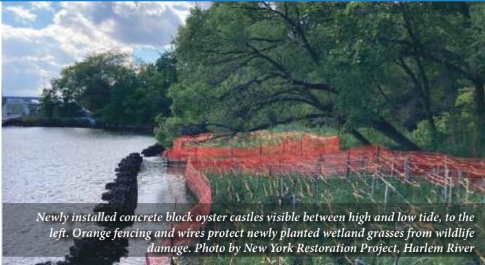
Newly installed concrete block oyster castles visible between high and low tide, to the left. Orange fencing and wires protect newly planted wetland grasses from wildlife damage. Photo by New York Restoration Project, Harlem River