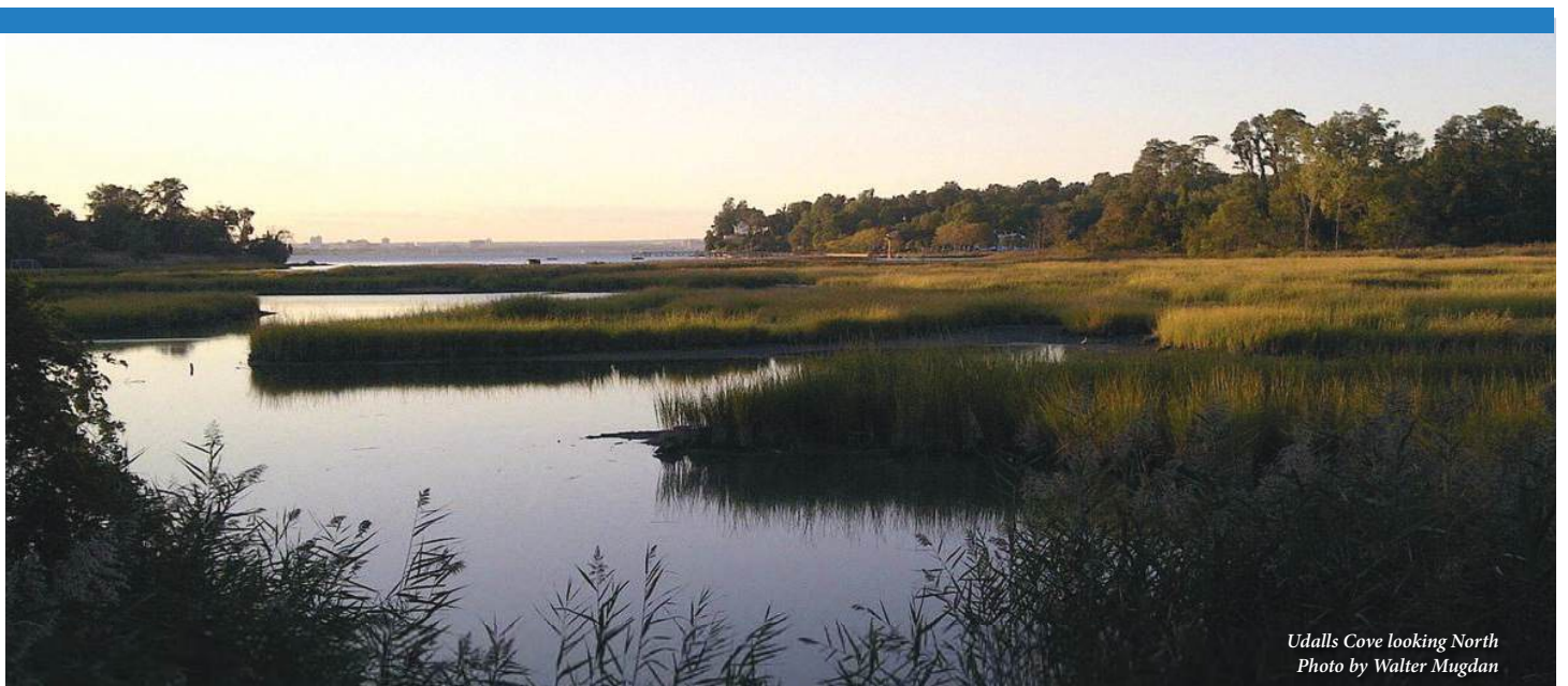
Udalls Cove looking North

UCPC’s efforts to preserve the remaining undeveloped areas between Douglaston, Little Neck and Great Neck were ultimately successful. On the Queens side of the county line, Udalls Cove Park extends north from Northern Boulevard to the open waters of Udalls Cove (although the park is divided into segments by the LIRR and the Back Road). On the Nassau side, the Village of Great Neck Estates dropped its plans to build a golf course and likewise protected the area as a park. Acquisition of the privately held properties designated for inclusion in Udalls Cove Park did not take place all at once and is still not complete. Today, more than 90% of the area is publicly owned, but a few acres in the Ravine remain to be acquired. Completion of that long process remains UCPC’s primary goal.